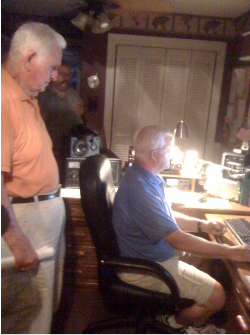
Illustration 1: KI4B showing W4BWG the PSK 31Demo